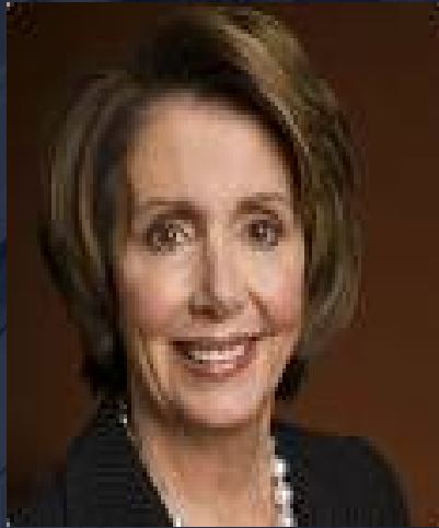
Nancy Pelosi (D-CA) Speaker of the House