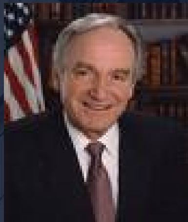
Tom Harkin (D-IA) Chairman