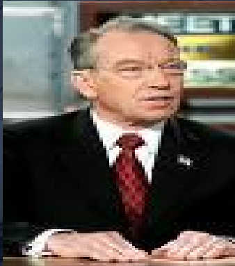
Chuck Grassley (R-IA) Ranking Member