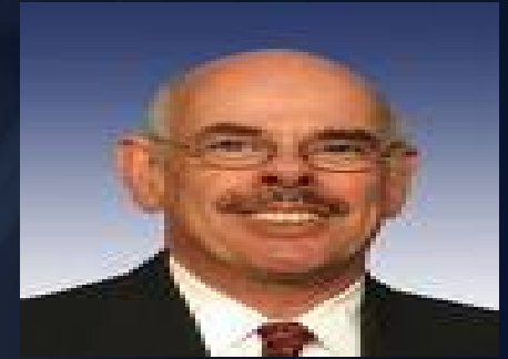
Henry Waxman (D-CA) Chairman