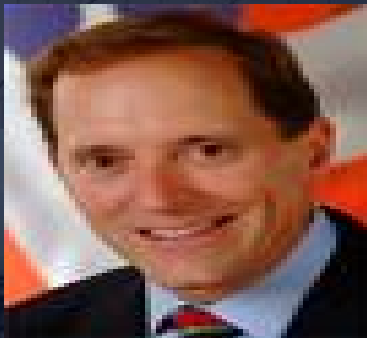
Dave Camp (R-MI) Ranking Member