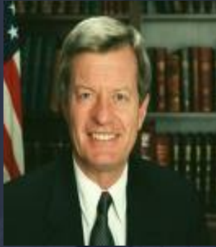
Max Baucus (D-MT) Chairman