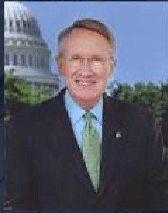
Harry Reid (D-NV) Majority Leader