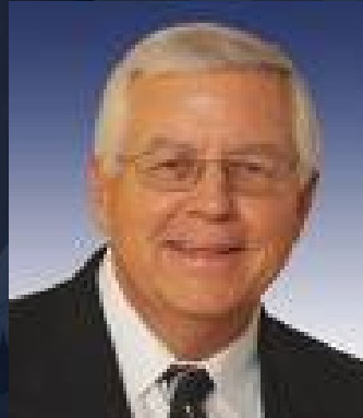
Mike Enzi (R-WY)