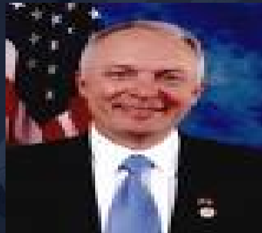
John Kline (R-MN) Ranking Member