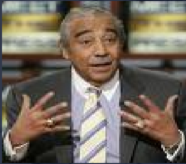
Charlie Rangel (D-NY) Chairman