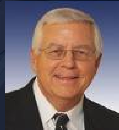
Mike Enzi (R-WY) Ranking Member