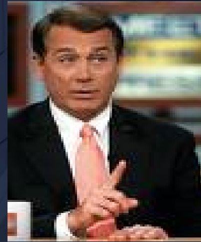
John Boehner (R-OH) Minority Leader