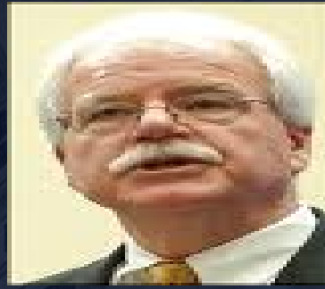
George Miller (D-CA) Chairman