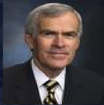
Jeff Bingaman (D-NM)