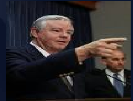
Joe Barton (R-TX) Ranking Member