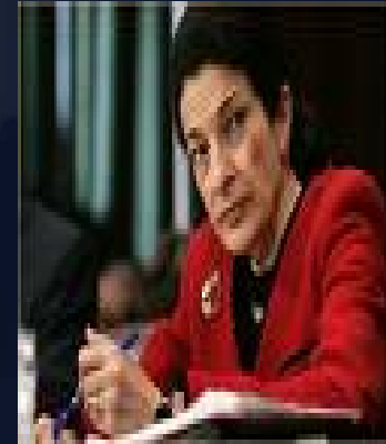
Olympia Snowe (R-ME)