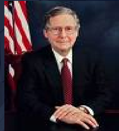
Mitch McConnell (R-KY) Minority Leader