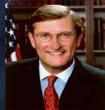
Kent Conrad (D-ND)